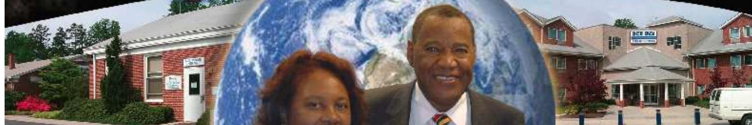
Dudley Beauty School System