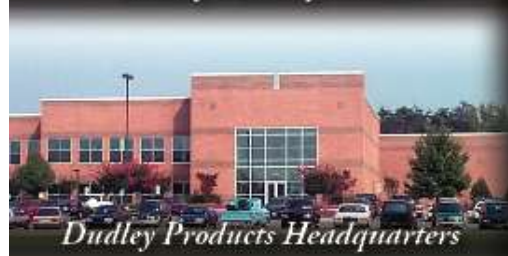
Dudley Products Headquarters

Welcome to the Expanding World of Dudley Products.