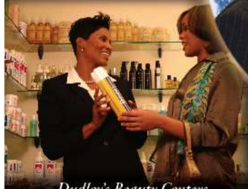
Dudley's Beauty Centers