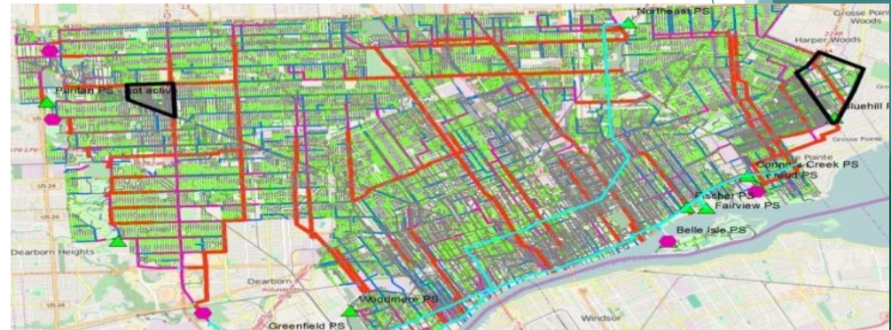
Maps of Detroit water (left) and sewer (right) systems